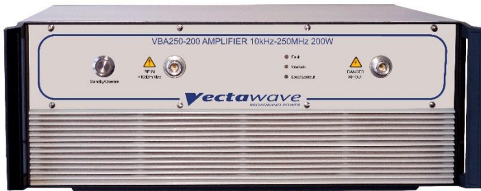
0.01-250MHz 200W P1dB